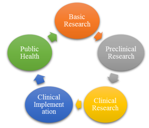
Figure 1 Translational Science Continuum Stages

In academic research, translation is the process of turning basic research into clinical interventions, such as medical devices, that improve the health of individuals and the public. NIH describes this process with five stages of the Translational Science Continuum as depicted in figure 1: Basic Research, Pre-Clinical Research, Clinical Research, Clinical Implementation, and Public Health. [8]