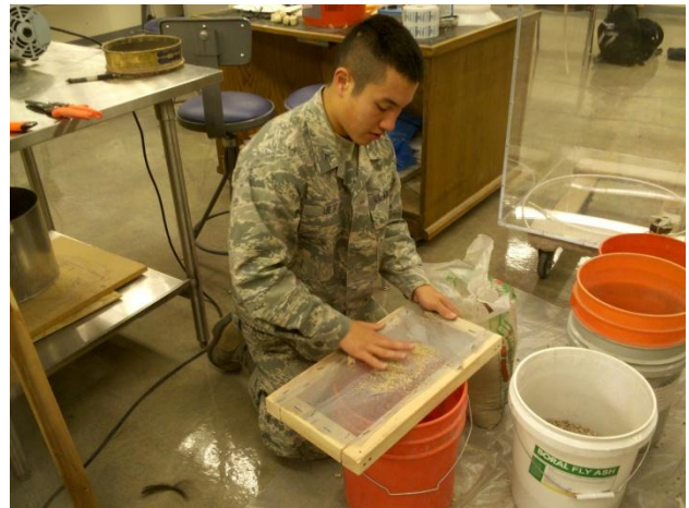
Figure 1 – Student tests a soil sieve after constructing it from wire mesh and wood

In-class observation and some student comments showed that students struggled a bit with the underdefined real-world problem. Of the three class sessions dedicated to developing their workshop and build a prototype bio-sand water filter, the students were slow to get started and were looking from direction from the instructors on how to get started. With some encouragement, the group developed a plan of action and began work. They researched what tools and materials might be available to locals by asking guest speakers who had spent time in Africa and searching the internet. They had to construct some of the specialized tools required to build a bio-sand water filter, such as sieves for separating soil particles by size as shown in Figure 1 below, then completely assembled a prototype.