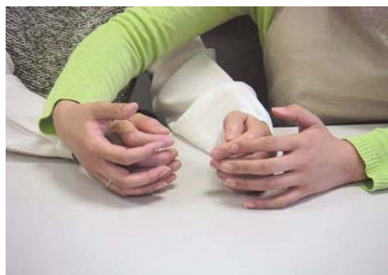
Fig.2 The Finger Braille