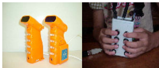
Fig.3 The "YUBITUKYI" (Left: Ver.1, Right: Ver.2)