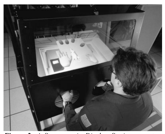
Figure 2: A Stereoscopic Display Station uses two digital projectors and polarized optics to provide a high-resolution immersive environment of about the same size as the working space of the Life Sciences Glovebox Facility.

A semi-immersive computer-based aid to training astronauts for future biological research in the LSG, called the "Virtual GloveboX" (VGX), is being developed at NASA Ames Research Center [5]. Astronauts and support crews can use the VGX for early engineering development and experiment planning, and later advanced training activities that require the LSG. The system integrates off-the-shelf hardware and software with new real-time simulation technologies to provide a realistic 3-D virtual environment, mimicking the real LSG environment. Within the VGX, the force of gravity can be turned on and off, allowing astronauts to perform experiments in a simulated microgravity environment while still on Earth. Further, a continuum of scenarios from ideal conditions to catastrophic experiment failures, such as contamination, can be introduced into the training session to allow the astronaut and principal investigator to assess critical decisions. The VGX does not eliminate the need for direct, hands-on training and experiment planning using physical mock-ups; however, it can streamline these processes, reduce the need for full-scale training sessions with live animals, increase the frequency and ease of the principal investigators input to their specific experiment, and provide astronauts with a means to keep their skills sharp on Earth and in space, thereby maximizing the efficiency and success of ground-breaking biological experiments in space.