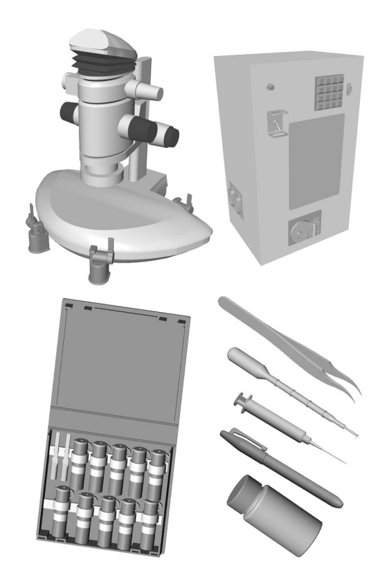
Figure 4: Examples of tools and equipment available for the VGX: a) stereo-microscope, b) mass measuring device, c) plant pollination kit and d) lab tools. Objects are not to scale.