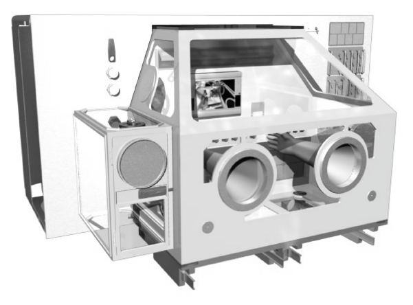
Figure 1: The Life Sciences Glovebox Facility (LSG) located in the Space Station Rack. The LSG is a pull-out enclosed workspace for isolating chemical and biological samples during space-based research experiments. Up to two astronauts may work in the glovebox at once. Power, video and data interfaces allow for a suite of lab equipment to be used. Deployment to the Space Station is currently scheduled for 2008.

For tasks aboard ISS requiring a larger glovebox work volume, the LSG will be used. When delivered to the Space Station, the LSG will be the largest, most complex glovebox system ever flown. Glove ports on two sides let up to two astronauts work simultaneously in the LSG which has a containment volume of nearly half a cubic meter and a floor space about 100 cm wide and 60 cm deep [3]. When extended from the Space Station rack in its deployed position, as shown in Figure 1 the LSG will provide the crew with a pull-out workbench for performing biology experiments in space. It is equipped with holding racks and an air-lock attachment for contained specimen transfer. A suite of experiment-unique equipment and supplies have been developed that take into account the microgravity environment in space and the unique constraints imposed on the astronauts both from environmental restrictions and through the glovebox interface. Astronauts who must perform LSG experiments in space are faced with achieving a very high level of proficiency on a suite of complex hardware with very little time to train. In addition, the inherent complexity of biology research increases the need for highly skilled and experienced operators. With