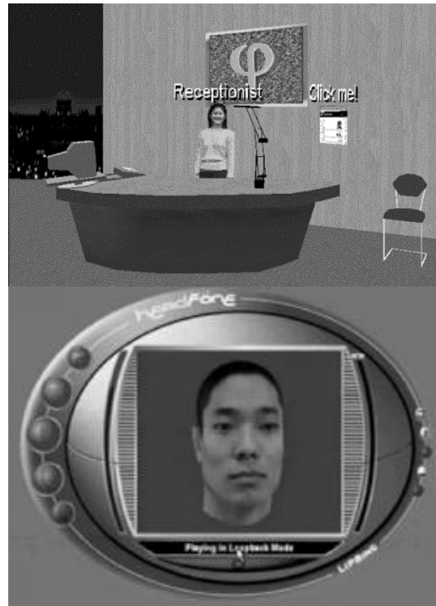
Figure 1. Screenshots of Virtual Sales Training World.