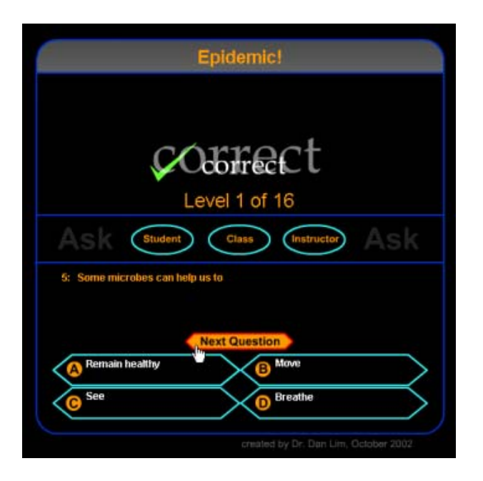
4. DESIGNING FLASH GAMES

The Flash Challenge Game Object is a very compelling learning tool as it keeps learners coming back again and again. It is not uncommon for learners to spend hours playing the game without "feeling" they are studying some "boring", "complex", or "difficult" content. The game requires a total of 80 questions. There are sixteen levels, of which each contains five questions. The game randomly selects one of the five questions within each level. Three lifelines are available to help them with challenging questions. Whether learners win the game or are "kicked out" because of a wrong answer, the new game button will appear allowing them to start a new game. Each new game will have a combination of repeated and new questions. Repeated questions reinforce learning while new questions maintain learners' continued interest in the game. As the correct answer is provided for each wrong answer, learners tend to remember it and answer it when the same question appears again in subsequent games. Below is the feedback from a student in a Spring 2002 class at the University of Minnesota, Crookston: