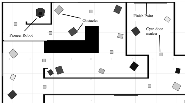
Figure 2. Simulated Maze World M_2

As stated earlier, environmental information is modelled with antigens and robot behaviours are modelled as antibodies that possess a fixed action component, and an idiotope and paratope element value for each antigen. For this purpose, eight antigens and sixteen antibodies are created as detailed in Tables 1 and 2 respectively and as in [3] where justification for choosing them is also given.