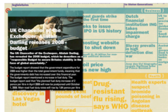
Figure 3. Interactive reading process

Eventually, the algorithm calculates the amount of reading and time spent with the article. Within this calculation, the amount of reading is compared with the available content and the 'weight' of the article is changed accordingly.