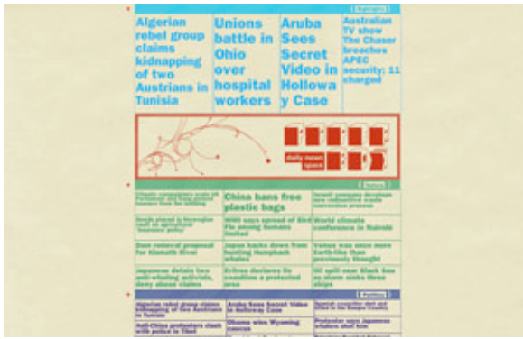
Figure 1. Treemap algorithm implementation

This approach gives the user the ability to see the whole system and visually compare information according to a chosen 'variables'. This characteristic of the treemap algorithm makes it highly adaptable in different contexts and enables the user to redefine the parameters of representation.