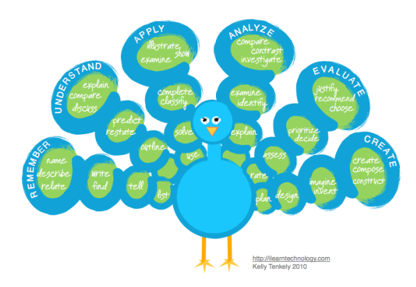
Figure 3: Kelly Tenkely's (2010), " Bloomin' Peacock " which illustrates how digital tools can align with the higher levels of Bloom's Taxonomy.

When used in combination with a tool, such as Poll Everywhere (www.PollEverywhere.com), educators may quiz students in class or after class to gain feedback or help focus teaching strategies. (Inge, 2013)