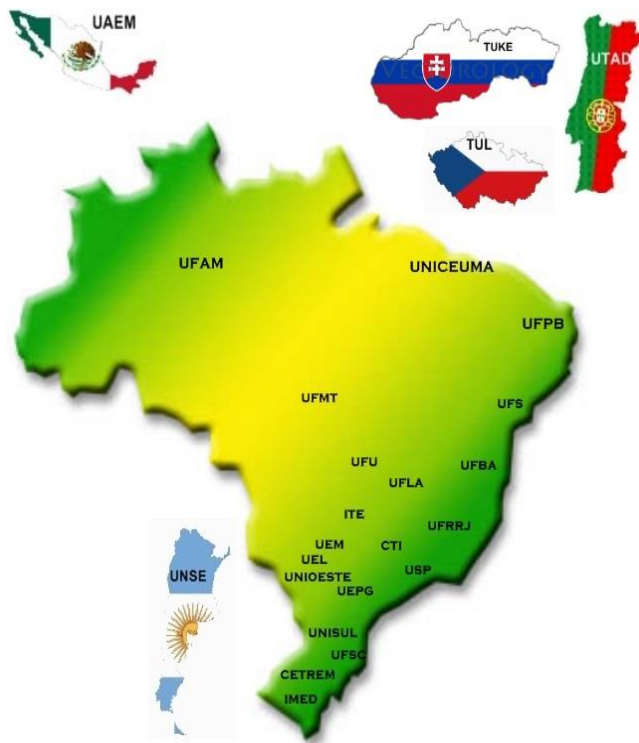
Figure 3 – Geographical distribution of the participating universities. At each Local identified on the map, the PQ [8,9] should be applied in at least five (5) hospitals. The goal is to reach about one hundred universities in this research project. There is no distinction on the kind of hospital, see reference [1.B]. The universities showed above means the ones where the research has been concluded.

The figure 3 shows the five major Brazilians regions (geographical distribution of participating institutions) where the research has been concluded (PQ application). Also presents the others countries where the research was finished.