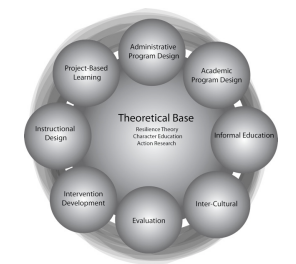
Design by Dr. Joseph Bowman, Jr. and Manulito Loman, M.L.S. Figure 1: Elements of the CUYT Model [8]

The CUYT design model uses several elements of instructional design in the development of the format, concepts, and structure of culturally relevant STEAM instruction. The goal is to develop program intervention models that reach underserved, economically challenged youth, in grades three through twelve, of both genders, all religions, and ethnically mixed, who have an interest in learning about STEAM fields. Many students are level 1 or 2 in middle school (under the New York State evaluation system) and/or special education in high school. Although written off, these students have great educational and academic potential if the academic environment can be changed and modified. New student centered, non-threatening, informal education environments and interventions need to be created to serve this population.