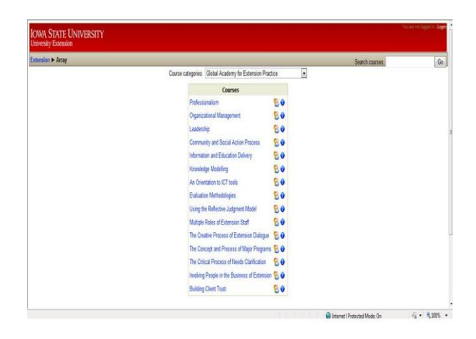
Figure 3. Global Academy for Extension Practice E-learning platform