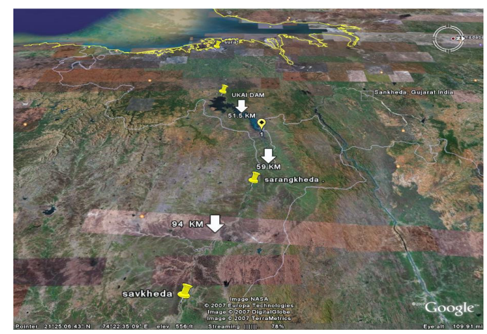
Fig.3 Savkheda, Sarangkheda gauging stations and Ukai dam.