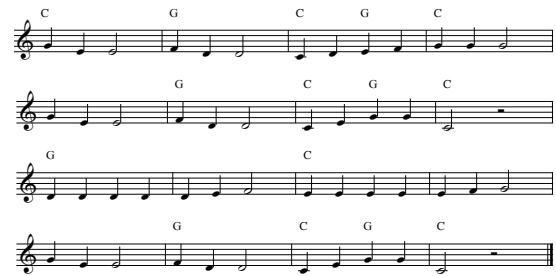
Figure 2: Reconstructed musical lead sheet

If we resolve the lead sheet graph of figure 1 by applying the information of table 1 and table 2 we can reconstruct the musical lead sheet, which has been the basis of the graph: