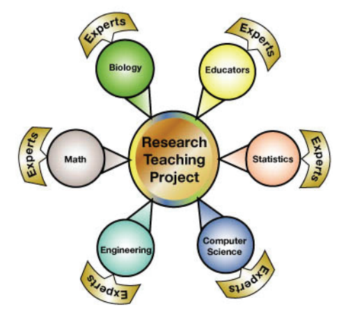
Figure 1. A multi-disciplinary, project-centric research and learning environment.

Three bioinformatics research problems were developed as modules by VBI scientists. These modules were combined with pre-existing teaching materials from a biotechnology course to create a CI-based Microbial Genomics course at Galileo Magnet High School. The