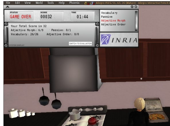
Figure 7. The final score

upgrade of half a point together with a feedback message containing the correct answer, i.e. “ Jean est un petit garçon ” (Jean is a little boy). The same input by an intermediate learner will score no point however as will an input by a beginner which fails on the current teaching goal such as here, “ Jean est un garçon petit ” where the “adjective order” exercise is incorrectly handled by the learner.