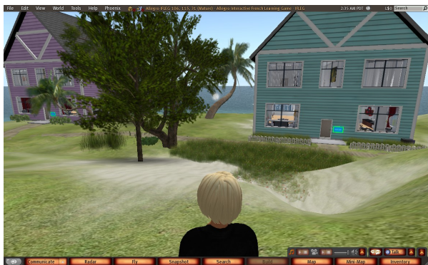
Figure 1. The I-FLEG Island.

A first person perspective is used whereby the learner is an avatar that can freely move in the game world. In order to start the game, she enters one of the houses where she can then interact with the 3D world by clicking on objects and entering text in a chat box.