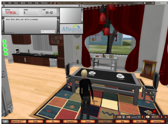
Figure 5. Example of tutorial interaction.

NLG module to generate exercises thus defining the grammatical coverage of the system. In the A1 level, the grammar used is restricted to cover the most basic syntactic constructions. This coverage then increases with the level of the learner.