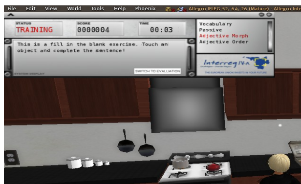
Figure 3. I-FLEG Game Hud.

We differentiate between the navigational instructions generated by the system to guide the user through the different phases of the game and the system feedback on learner input. The system uses English as a language for guiding the user through the game and for explaining training activities but French, the target language, for feedback messages and error correction.