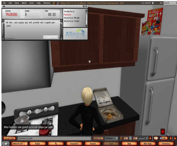
Figure 6. Example of user/system interaction during the training phase.

the learner input against one or more expected answers (targets) allowing for minor deviations such as differences in capitalization, determiner definiteness and punctuation. Although this is obviously limited, the training activities currently proposed are sufficiently constrained for the error detection mechanism to be adequate. Using this mechanism, the system provides the learner with two types of feedback namely, a verbal and a numerical feedback. The verbal feedback indicates whether the answer given by the learner is correct or not. In case it is not, the target answer is displayed thereby giving the learner the correct solution.