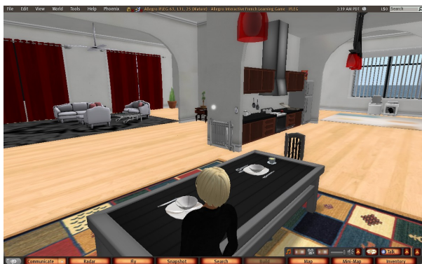
Figure 2. The interior of an I-FLEG house.

The game responds through messages displayed in the Head-Up Display (HUD, Figure 3) which acts as a virtual tutor guiding the player throughout the game. The upper part of the HUD shows information about the current state of the game, the score of the player and the elapsed time. The main window in the center of the HUD is used for guiding the navigation of the learner through the game world, for communicating learning exercises to the learner, and for conveying feedback information. The menu on the right lists the grammar topics (also called teaching goals) that can be exercised in a given