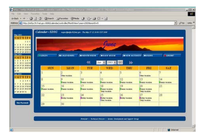
Figure 5. A calendar application.

The framework has been successfully employed in the development of such data-centered applications as the Accelerator Component Test Result Report System to access results of magnetic measurements [2][3] and the Operations Activity Calendar utility (Figure 5) and the Group Planning utility, where it proved to be both powerful and easy to use.