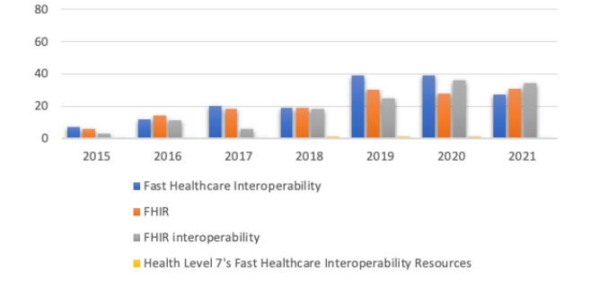
Web of Science Paper Distribution

PubMed Paper Distribution 80 60 40 20 0 2015 2017 2018 2019 2020 2021 2016 Fast Healthcare Interoperability FHIR ■ FHIR interoperability Health Level 7's Fast Healthcare Interoperability Resources