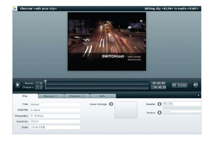
Fig. 3. SWITCHcast software used for video editing to prepare the lectures to be used in the "Annotated Lectures" system. Retrieved from: <u>https://cast.switch.ch/resources/SWITCHcast_manual.pdf</u>

Fig. 2. Initial GUI design of the "Annotated Lectures" system integrated in "UniWorld", a 3D collaborative virtual environment.