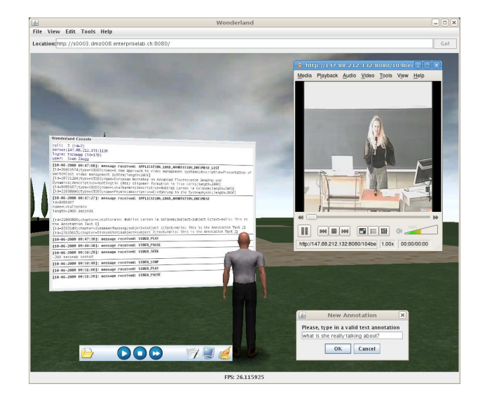
Fig. 2. Initial GUI design of the "Annotated Lectures" system integrated in "UniWorld", a 3D collaborative virtual environment.

The lecturer is recorded during his/her presentation in the global lecture hall and the video is post-processed using the SWITCHcast <sup>3</sup> software (see Figure 3). The SWITCHcast desktop application facilitates the local recording of audio and video data and slides. The recorded lectures are then uploaded to the SWITCHcast webserver where an authorized person can edit the video. It can be divided into chapters using a Web Cutting tool and enhanced with halts at slides showing questions or assignments. This information is stored in a metadata file (* json), which is automatically parsed and read into the application database. After these steps a lecture video is available in the "Annotated Lectures" system.