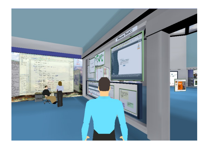
Fig. 1. Collaboration in 3D CVE: Virtual meeting rooms with application sharing facilities.

A 3D CVE (named "UniWorld") is currently being developed at the University of Zurich using Sun Microsystems' Project Wonderland toolkit<sup>2</sup> in order to comply with the requirements of large-scale global collaboration (see Figure 1). This opensource toolkit enables the customized design of the virtual environment, the extension of communication tools, such as immersive audio and cameras into the real world [12], and collaboration features, such as virtual team rooms with shared applications, and the implementation of authentication schemes.