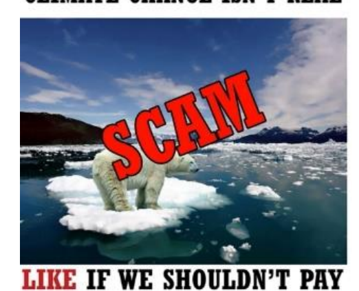
CLIMATE CHANGE TAXES Figure 3. Right-Leaning Climate Change Meme (Meme 3)