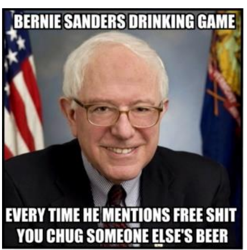
Figure 5. Right-Leaning Socialism Meme (Meme 5)