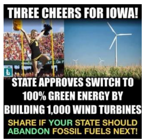
Figure 2. Left-Leaning Climate Change Meme (Meme 2)