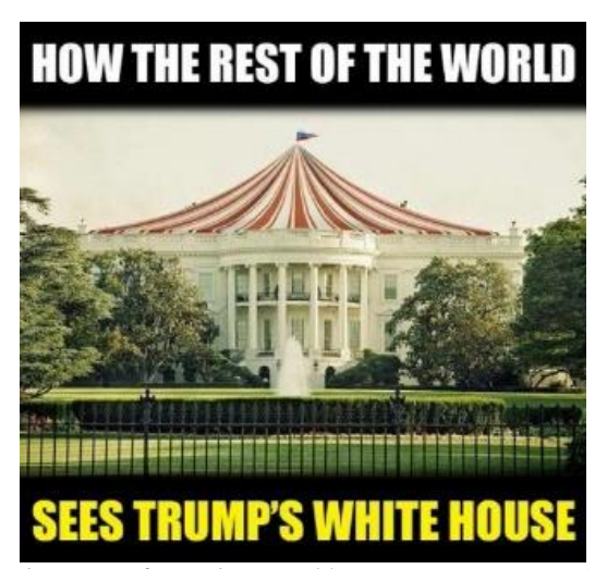
Figure 6. Left-Leaning Donald Trump Meme (Meme 6)