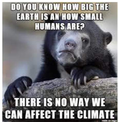
Figure 1. Right-Leaning Climate Change Meme (Meme 1)