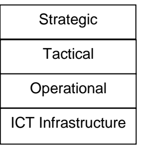
Figure 2: ICT as an infrastructure

We define the term infrastructure as the basic, underlying structure of a system or organization, it is compulsory, or something an employee can or should take as granted. All employees will typically use ICT as an infrastructure in their daily work to fulfil their responsibilities. This can be illustrated as in Figure 2.