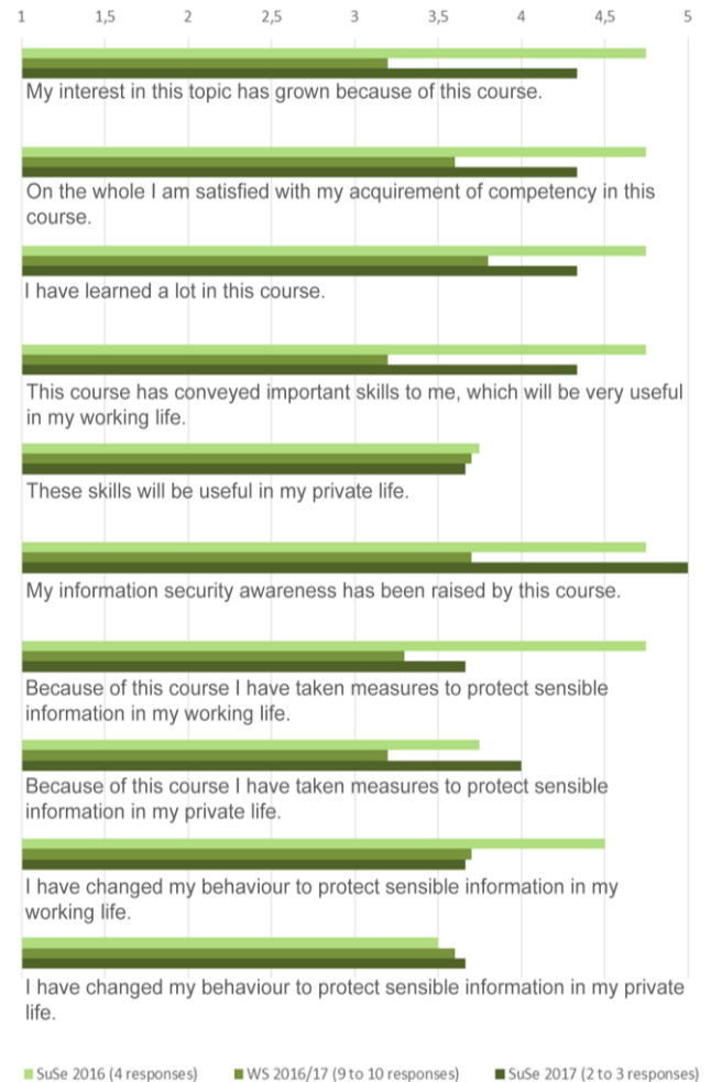
Fig. 4 Measures to protect sensitive information. Self-assessment of the learning success (1=disagree, 5=agree)

In SuSe 2017 six students (1 female, 5 male) on the accompanying Business Administration program chose the compulsory elective subject “Sensitization for Information Security.” These students were also very interested in the topic and five of them worked hard to attain the IT security officer certificate. Three of them completed the exam successfully.