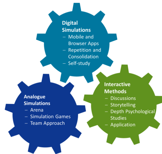
Fig. 2 Integrated learning 3.0 approach in “SecAware4job”

strategies have their own advantages and the difficulty is to combine these two types of learning strategies and to find a balanced relationship between them [15].