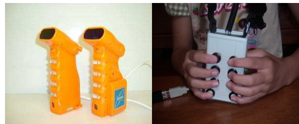
Fig.3 The "YUBITUKYI" (Left: Ver.1, Right: Ver.2)

The "YUBITUKYI" is made with electrical devices (at present having been improved). Therefore, the data of the "YUBITUKYI" are treated and processed with electric signals and their transformed signals, and at the