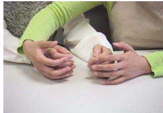
Fig.2 The Finger Braille