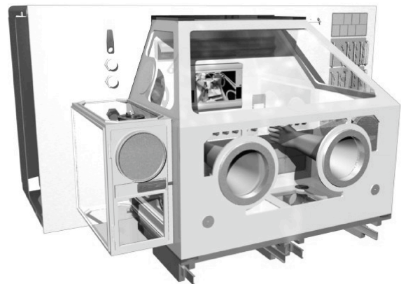
Figure 1: The Life Sciences Glovebox Facility (LSG) located in the Space Station Rack. The LSG is a pull-out enclosed workspace for isolating chemical and biological samples during space-based research experiments. Up to two astronauts may work in the glovebox at once. Power, video and data interfaces allow for a suite of lab equipment to be used. Deployment to the Space Station is currently scheduled for 2008.

For tasks aboard ISS requiring a larger glovebox work volume, the LSG will be used. When delivered to the Space Station, the LSG will be the largest, most complex glovebox system ever flown. Glove ports on two sides let up to two astronauts work simultaneously in the LSG which has a containment volume of nearly half a cubic meter and a floor space about 100 cm wide and 60 cm deep [3]. When extended from the Space Station rack in its deployed position, as shown in Figure 1 the LSG will provide the crew with a pull-out workbench for performing biology experiments in space. It is equipped with holding racks and an air-lock attachment for contained specimen transfer. A suite of experiment-unique equipment and supplies have been developed that take into account the microgravity environment in space and the unique constraints imposed on the astronauts both from environmental restrictions and through the glovebox interface. Astronauts who must perform LSG experiments in space are faced with achieving a very high level of proficiency on a suite of complex hardware with very little time to train. In addition, the inherent complexity of biology research increases the need for highly skilled and experienced operators. With