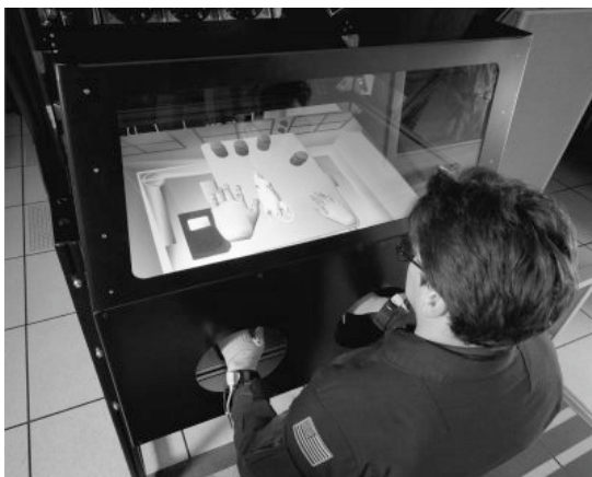
Figure 2: A Stereoscopic Display Station uses two digital projectors and polarized optics to provide a high-resolution immersive environment of about the same size as the working space of the Life Sciences Glovebox Facility.

A semi-immersive computer-based aid to training astronauts for future biological research in the LSG, called the “Virtual GloveboX” (VGX), is being developed at NASA Ames Research Center [5]. Astronauts and support crews can use the VGX for early engineering development and experiment planning, and later advanced training activities that require the LSG. The system integrates off-the-shelf hardware and software with new real-time simulation technologies to provide a realistic 3-D virtual environment, mimicking the real LSG environment. Within the VGX, the force of gravity can be turned on and off, allowing astronauts to perform experiments in a simulated microgravity environment while still on Earth. Further, a continuum of scenarios from ideal conditions to catastrophic experiment failures, such as contamination, can be introduced into the training session to allow the astronaut and principal investigator to assess critical decisions. The VGX does not eliminate the need for direct, hands-on training and experiment planning using physical mock-ups; however, it can streamline these processes, reduce the need for full-scale training sessions with live animals, increase the frequency and ease of the principal investigators input to their specific experiment, and provide astronauts with a means to keep their skills sharp on Earth and in space, thereby maximizing the efficiency and success of ground-breaking biological experiments in space.