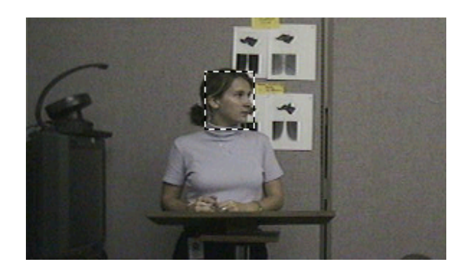
Figure 5. Screenshot of the face localization and tracking result

Figure 4 shows the actual client map for the process presented above as well as additional processing for spoken language processing. Two branches are represented on this map. The first, shown across the bottom part of the figure, implements the client steps presented for the source bearing estimation of a speaker. The second branch, making a serpentine path from the top to the middle, implements a multi step pipeline for the computation of a Mel Frequency Cepstrum from a beamformed source. The Finite Impulse Response (FIR) filtering provides signal conditioning to remove the low frequency noise present in most buildings. Next is the Cepstrum, a feature extraction algorithm for speech signals commonly used for speech recognition and speaker identification. The processing steps include preemphasis filtering to flatten the spectrum, time domain windowing to