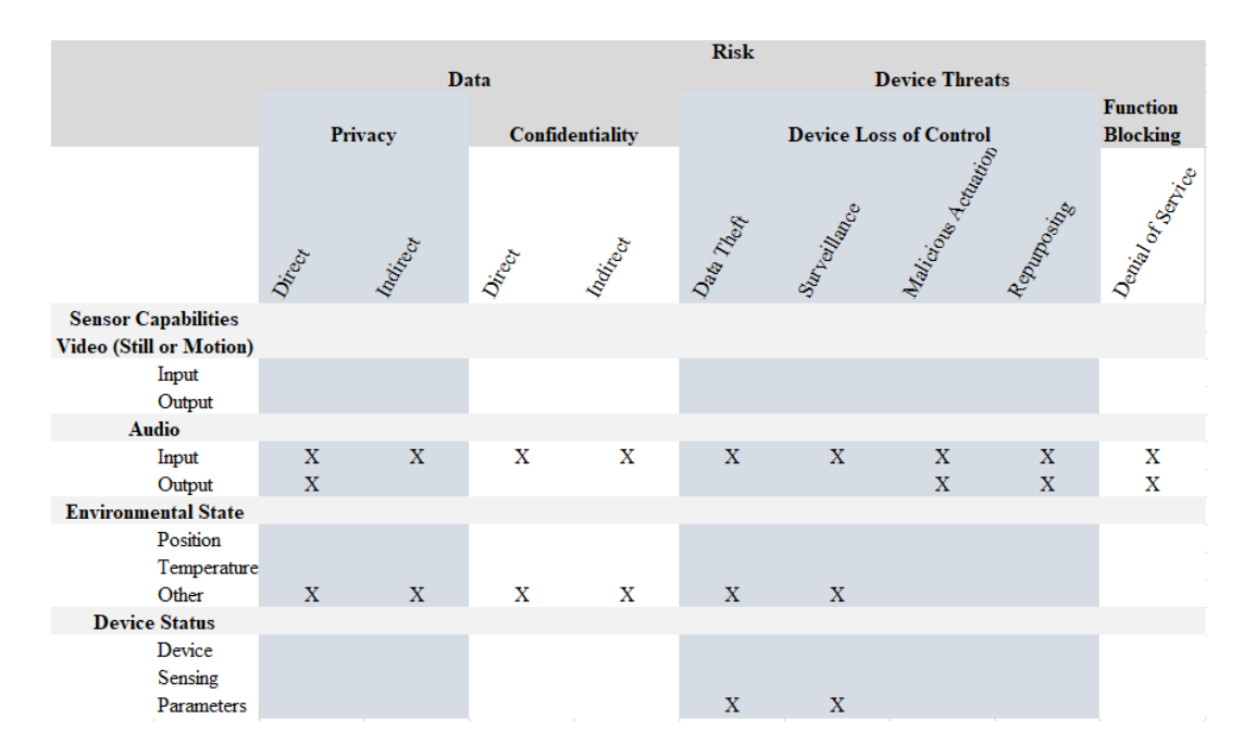
Table 2. Sensing Layer (Amazon Echo Dot Example)

connection (as well as through Bluetooth, if enabled). Functionality for the device is managed via its onboard software and its communication with a third-party service provider (i.e., Amazon). The Echo device software also has an extensible framework for adding additional features, as well as allowing it to interface and possibly control other devices. Control of other devices depends on a software interface providing access to the other device's third party services.