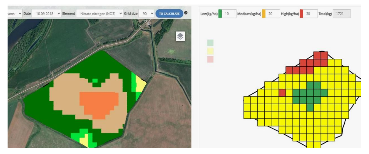
Figure 3: The results of chemical analysis of the field (left) on the concentration of nutrients and the technical task on the differentiated fertilizer application (right) in the IS Soft.Farm

The efficiency of using differentiated application of fertilizers compared to the application of the norms is on average 15%. The task is easily reduced to economic calculations for specific types of fertilizers. Students demonstrably trace not only the agronomic aspect of the application of the information system, but also environmental, and economical results.