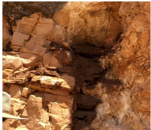
Fig. 13. Solid “Brown Ooze” was once liquid and “Dripped” down the canyon termination like stair steps, then froze solid. See dark cavity above Larry’s shoulders in Fig. 12. Does modern day lightning explain this feature? [8]

structures? How does erosion create these internal structures that weather out? Does some type of secondary replacement mineralization occur that hardens these arched shaped structures? Electric currents are known to fuse quartz in “vitreous” lighting rocks or Fulgurites. Andy Hall stated in his article, “Arc blast is the consequence of arc flash in a surface conductive current discharge” [10, 11]. He explains this statement earlier in the article; “Earth acts like a gas giant, integral to the circuitry, with current flowing through, as well as around it, but Earth’s current flows in a liquid plasma – the molten magma below the crust. In the event the system is energized, current discharges from within. The evidence is in the extensive volcanism on Earth. Volcanoes straddle subduction zones at the edges of continental plates, rift zones and mid-ocean ridges. They betray the flow of current beneath the crust” [10, 11]. Could this be the case for the Dragons Egg “pottery”? Does a Bennett Z-pinch also cause Dragons Eggs? Can geodes also be some similar version of these processes? We did find a row of Dragons Eggs high on a ridge. A drone will be necessary to further investigate them.