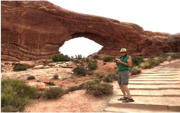
Fig. 6. Arches National Park [8].