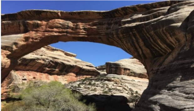
Fig. 7. Natural Bridges, Utah [8].