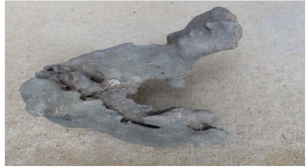
Fig. 10. Palm sized Fulgurite from Chandelier Barrier Island, LA.

Figure 9 show these lateral arch formations are extensive formations throughout the Canyonlands National Park and beyond. Extrapolating this idea to the larger interplanetary lightning scale envisioned, leads to the possible conclusion that if ocean basins were carved out by this process sending the seafloor into orbit as asteroids, then very likely the magnetic signatures of mid-ocean ridges are the product of a lateral co-rotating Brikeland current, not the product of seafloor spreading as proposed in the plate tectonic paradigm. In other word the magnetic stripes on the seafloor are a lateral cut away view of the double layering effect!