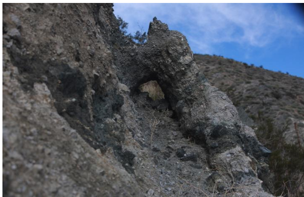
Fig. 3. Metamorphic Nonconformity - Whitewater California near Palm Springs resembles other features nicknamed “Dragon Eggs” that have been found in various rock types and locations.

Nonconformity occurs when sedimentary rock is lying on metamorphic rock (Fig. 3). The contact between them is recognized due to the different structure of both the rocks. The igneous or metamorphic rock will not be in layers whereas the sedimentary rock is layered. The close examination of the layers enables recognition of the difference between them. Lack of contact metamorphism in the sedimentary layer generally indicates the sediment was deposited after and over the metamorphic event.