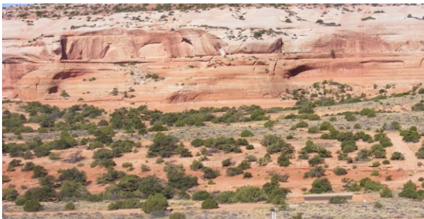
Fig. 9. Lateral arches in various States of Erosion can be seen along this highway stop just south of La Sal, Utah. These features are common in many locales and are hypothesized to be the same features associated with Arches National Park formations [8].

Figure 9 show these lateral arch formations are extensive formations throughout the Canyonlands National Park and beyond. Extrapolating this idea to the larger interplanetary lightning scale envisioned, leads to the possible conclusion that if ocean basins were carved out by this process sending the seafloor into orbit as asteroids, then very likely the magnetic signatures of mid-ocean ridges are the product of a lateral co-rotating Brikeland current, not the product of seafloor spreading as proposed in the plate tectonic paradigm. In other word the magnetic stripes on the seafloor are a lateral cut away view of the double layering effect!