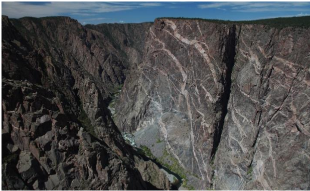
Fig. 15. Quartz in Canyon Sides at the Black Canyon of the Gunnison, CO with quartz intrusions up to 30 meters wide.

What can “Electric Eyes” say about the picture above? Notice these quartz intrusions mostly go from top all the way to the ground as if they could be continuations of huge lightning bolts.