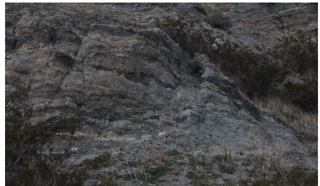
Fig. 4. Metamorphic Nonconformity This is a wider shot of the “non-conformity” shown in Fig. 3. Geologist using a loupe magnifier examined the native rock determining this formation was “highly metamorphic!”

What are some examples of Electric Geology? There seems to be some of hint of Electric Universe co-rotating energetic double layers exposed in this geologic section (Fig. 5). Possibly the Arches National Park (Fig. 6) and Natural Bridges (Fig. 7) are both caused by erosion, but the Arch we saw on the north side of Long Canyon (Fig. 8) might be more difficult to explain by erosion. The arch preexists any erosion and is imbedded laterally within the geologic unit.