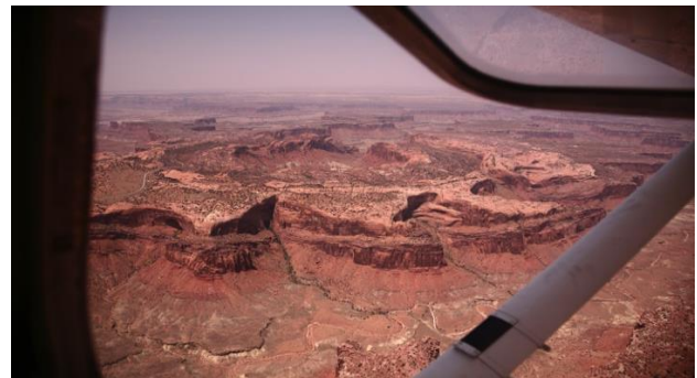
Fig. 2. Upheaval Dome from Air [1] Canyonlands National Park in Utah exhibits features of a “Diocotron Instability” (Photo by Michael Steinbacher).

The genesis of Upheaval Dome, chevron structures, and arch formations (Fig. 2) could have simple Electric Universe explanations. Upheaval Dome was likely created originally as a blister on Earth’s surface caused by an electric arc filament separated from the main arc current, which goes to ground. A geological example of “Diocotron Instability” (Fig. 2) demonstrates how this affect could simply be mirrored at planetary scale when applied to Upheaval Dome genesis.