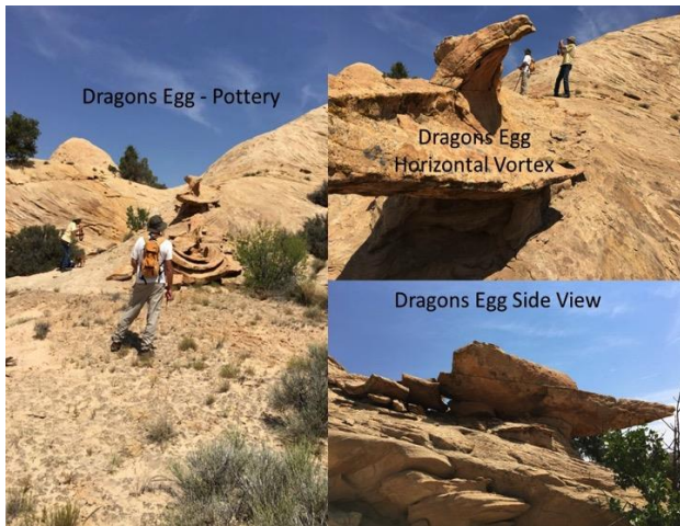
Fig. 11. “Dragons Egg” Pottery created by a horizontal electric current? Larry White with Andy Hall in Arc Blast Field Investigations [8].

Mangaement (BLM) canyon, north of the Goblin Valley that very likely indicates the occurrence of an electrical event. Two specific features that stand out are the Dragons Egg and Slot Canyon (Figs. 11, 12, & 13).