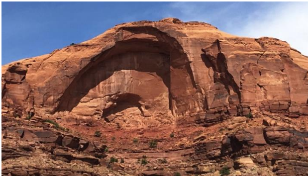
Fig. 8. Canyonlands Arch formation in Long Canyon just north of Dead Horse Point State Park in Utah. Possibly Wingate Sandstone. Note the hint of co-rotating double layers exposed in this geologic section [8].