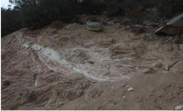
Fig. 14. Rock Lightning is Quartz – Mt. Whitney, CA.

The author saw this beautiful rock with a Lichtenburg pattern near Mt. Whitney (Fig. 14). The conventional explanation of these quartz intrusions is that geothermal waters transporting silicate solutions into cracks in the native rock causes them. It seems we may need a better explanation for quartz veins in general. What do “Electric Eyes” see?