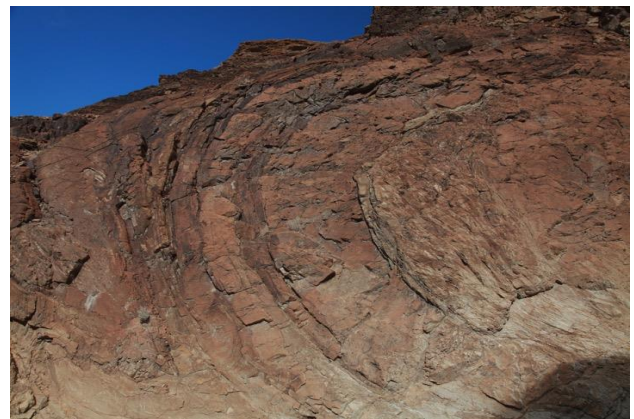
Fig. 5. Bull's Eye Formation is a signature of the co-rotating “Double Layer” electrical phenomena effect of a Brikeland current. This is seen in rocks fairly often. A large Brikeland current could create this effect; you just wouldn't want to be nearby!

The arch in Fig. 8 forms in a thick sequence, that looks like the Wingate Sandstone, an eolian airborne deposit, sitting on top of Chinile Formation, a silt-mud, or clay lake deposit. Water was likely present in the sandstone aquifer layer where the central “hole” is located within the central Arch and where large electric currents propagated above the clays along the wet sandstone aquifer.