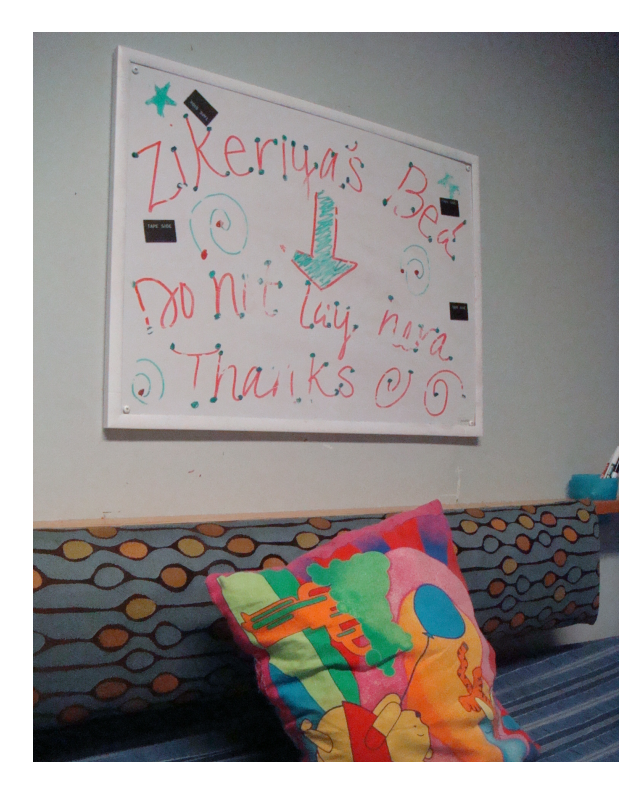
Figure 4. Example of territorial behavior shown by a child inhabiting the study's altered bedroom.

In summation, this research study, aided through its use of case study methodology, revealed potentially key points for homeless shelter environments and links between built space and sense of personal control. Further follow up of these ideas may lead to guidelines for future shelters that provide enhanced comfort to homeless persons at a time of particular crisis in their lives. In short, it made sense to start with small samples to determine potential foundation-level theory that case study makes possible, then build on these initial findings through subsequent studies. The flexibility and usefulness of the case study method was central to the study's outcomes, and more broadly for investigation of issues concerning this compromised population.