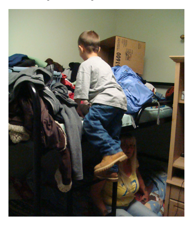
Figure 3. A child living in the study's unimproved bedroom reportedly got into trouble more often, potentially because there were fewer acceptable opportunities for stimulation than in the altered bedroom.