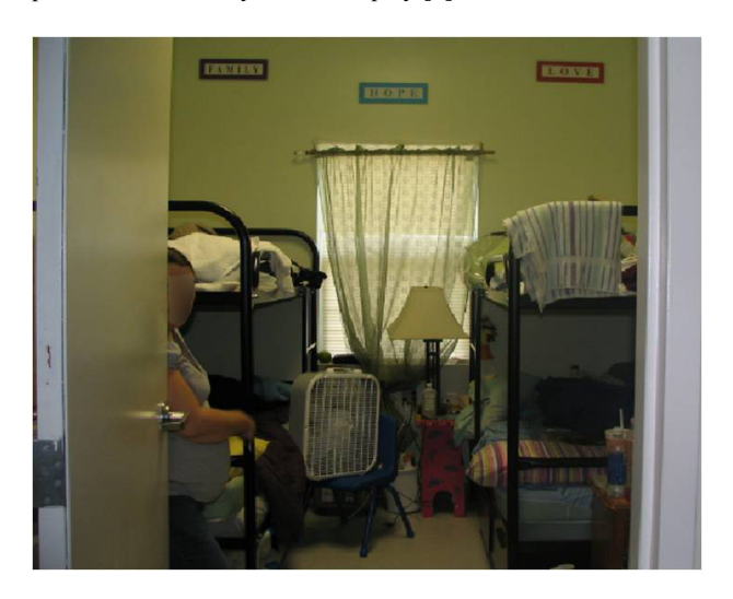
Figure 1. A typical 9' x 12' bedroom for a family of four living in a homeless shelter. Length of occupancy can range from 3 months to a year.

The idea of personal control from the psychology field influenced the focus of this study. A sense of personal control over one's life experience may be very important, as researchers generally agree that this feeling is central to self-worth [2, 3]. A sense of personal control "may serve to alter an individual's expectations about the value of voluntary responses and to influence one's self-perceptions as a competent human being" [3, p. 222]. Somewhat less researched is the built environment's role in supporting or suppressing this sense of personal control. Researchers have described that there are no lack of environmental psychology studies, but little work has been done that specifically explores how people use architectural design to cope with less-than-ideal living conditions, including how personal control may come into play [4].