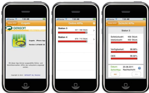
Figure 3: Native iPhone interface with iLegato KPI-App

Using for example the iLegato KPI-App (s. Fig. 3) the employee has the possibility to access the subscribed key data of his production sector any time. Based on the OEE, it is possible to use additional key data of the node for assessment. Alerts und process values can easily be observed and if necessary actions initiated. The configuration is made comfortably in an easy way via the regular web client of the control system, executable on a standard web browser.