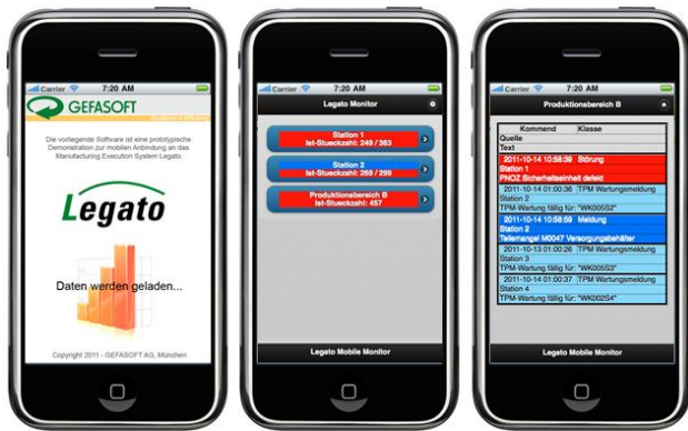
Figure 4: PhoneGap interface with iLegato Monitor-App

apps) nor purely web based (many of the functions would be supported by HTML5). One disadvantage is that hybrid applications do not always have full access to the device application programming interface (API), it depends from the used OS.