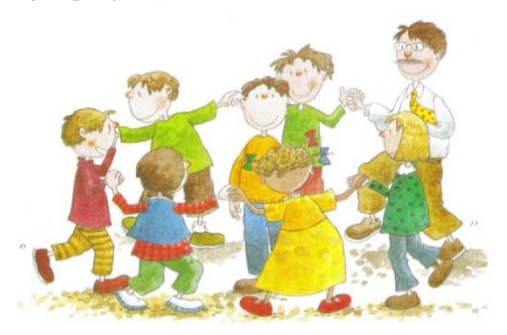
Figure 1- "Nursery Rhymes" [12]

A - The teacher shows the children the activity "Nursery Rhymes", using as an example popular music, and forming a circle in group together with the children.