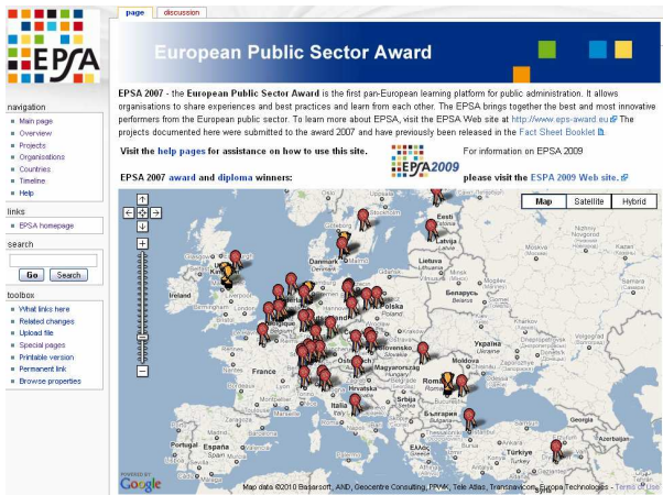
Figure 5: No wiki approach, but wiki technology is being used at www.epsa-projects.eu .

Another demonstration of the benefits and features of Semantic MediaWiki for the creation of an online database with a focus on text information enriched with metadata (represented by semantics) can be seen at EPSA 2007: the submissions to the European Public Sector Award were published in a “fact sheet booklet” that is now available as a semantic wiki [25]. As the submissions for the EPSA 2007 award are not subject to change, the site uses semantic wiki technology without being a real wiki where users are encouraged to add or change content. The EPSA 2007 example shows that Semantic MediaWiki can not only be used for Web 2.0 platforms, but also as an effective means to create conventional online databases.