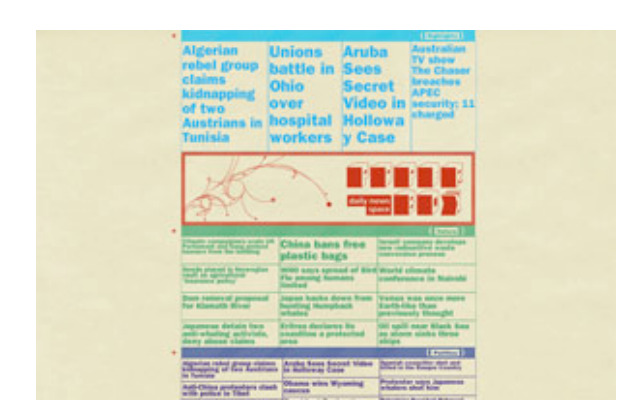
Figure 1. Treemap algorithm implementation

This approach gives the user the ability to see the whole system and visually compare information according to a chosen 'variables'. This characteristic of the treemap algorithm makes it highly adaptable in different contexts and enables the user to redefine the parameters of representation.