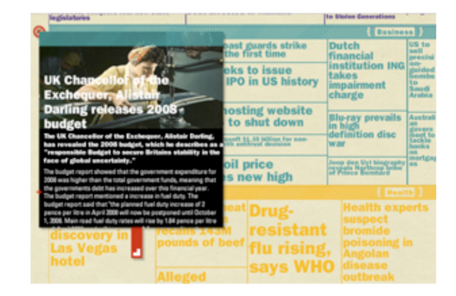
Figure 3. Interactive reading process

Eventually, the algorithm calculates the amount of reading and time spent with the article. Within this calculation, the amount of reading is compared with the available content and the 'weight' of the article is changed accordingly.