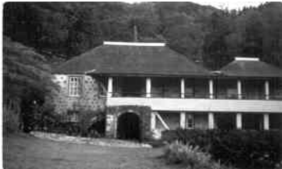
Figure 3. House of former coffee plantation owner