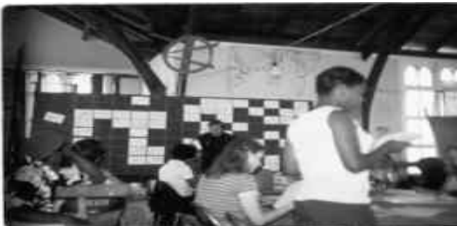
Figure 7. Generating and clustering ideas