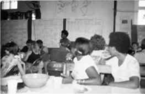
Figure 9. Who will do what, when and how?