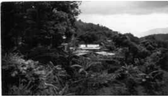
Figure 1. Mango and banana trees