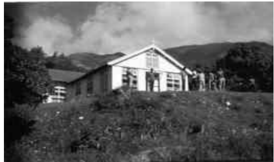
Figure 4. The church where meetings were held