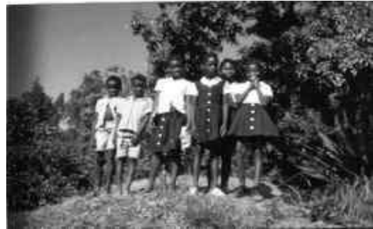
Figure 6. Children ready for school