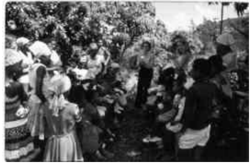
Figure 10. Organizing a preschool