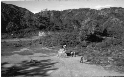
Figure 11. The cricket field with a large rock