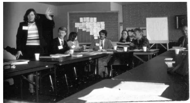
Figure 16. A planning meeting for ASC