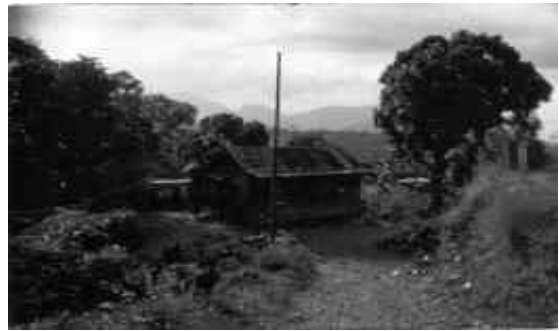
Figure 2. Wood house with metal roof