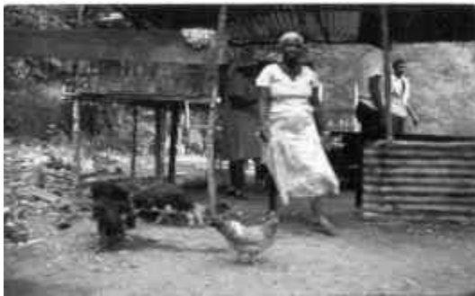
Figure 5. The kitchen for preparing food