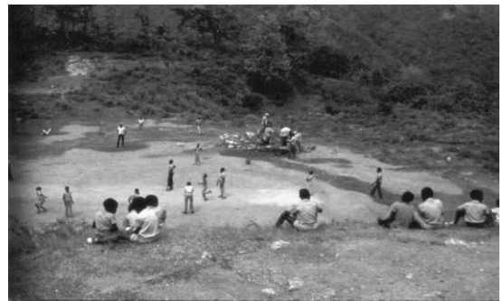
Figure 14. Throwing water on the hot rock