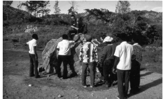
Figure 12. Enlarging cracks in the rock