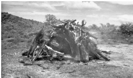
Figure 13. Making the rock very hot