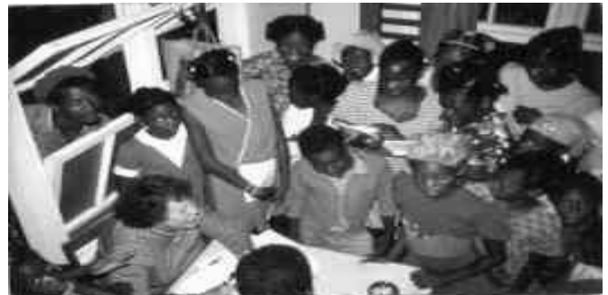
Figure 8. Children watch the report writing process