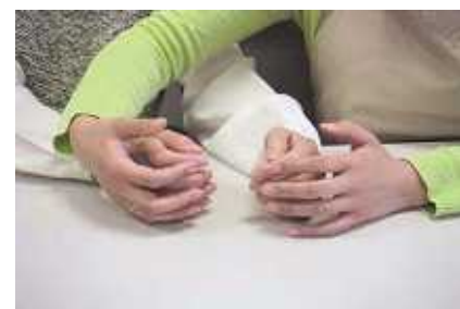
Fig.2 The Finger Braille