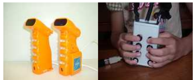
Fig.3 The "YUBITUKYI" (Left: Ver.1, Right: Ver.2)

As the "YUBITUKYI" is the electrical devices (at present having been improved), its signals are treated